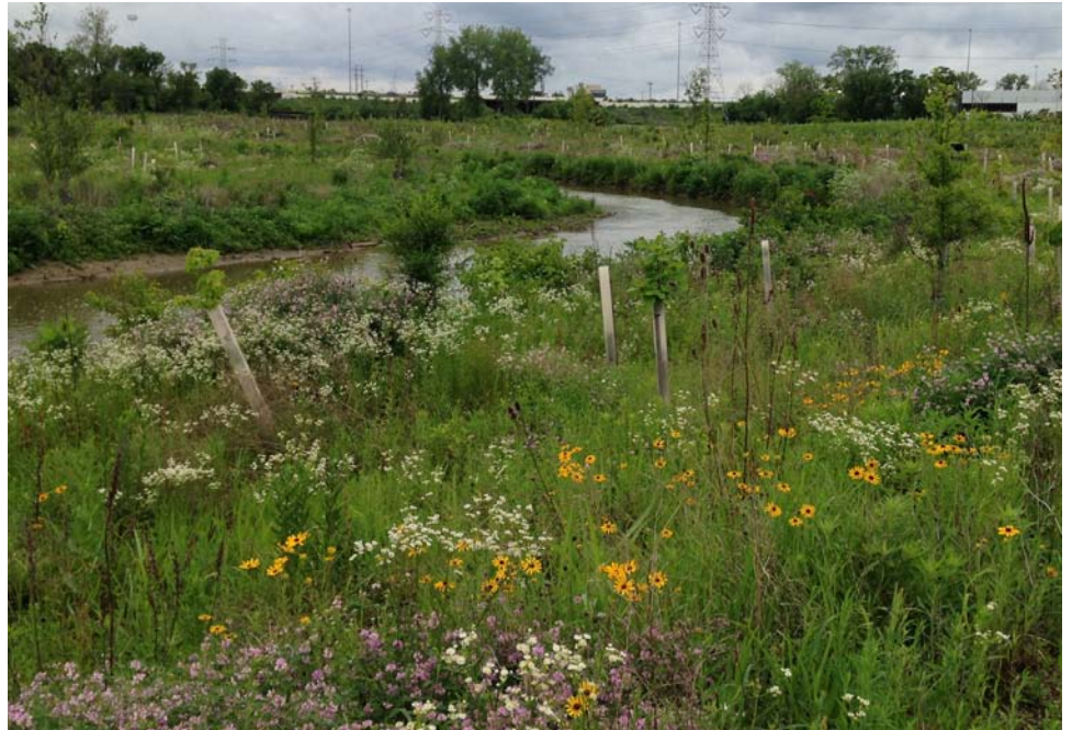
Wildflowers bloom along the East Fork Mill Creek in Twin Creek Preserve, June 2014

info@millcreekwatershed.org millcreekwatershed.org