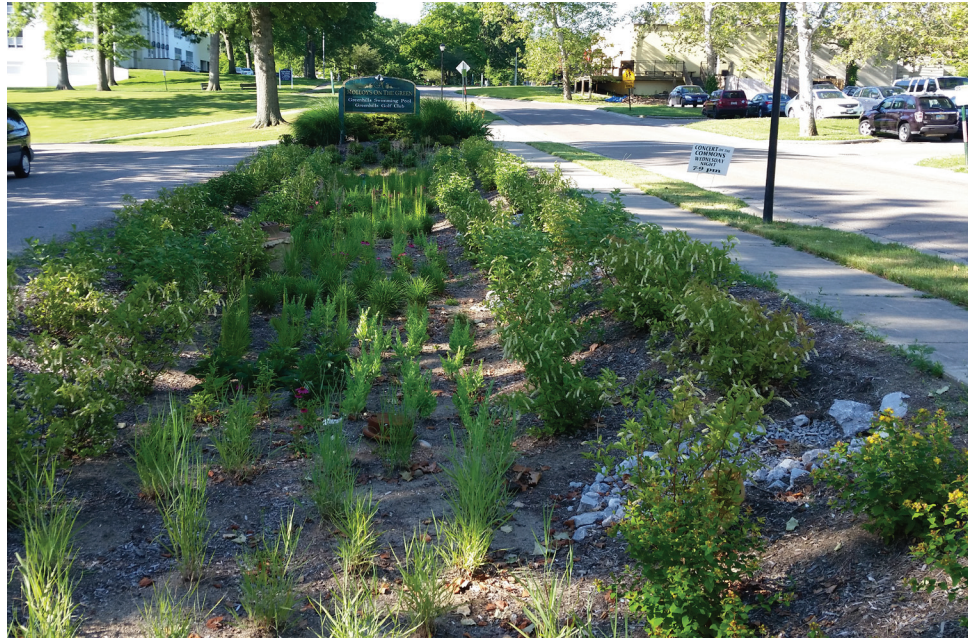
The stormwater bioretention basin constructed as a part of the Greenhills Shopping Center Drainage and Rainwater harvesting Project

info@millcreekwatershed.org millcreekwatershed.org